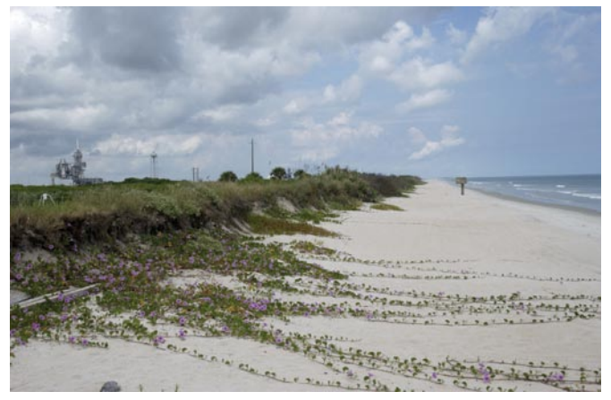
Launch pads at NASA's Kennedy Space Center border the beaches south of Cape Canaveral National Seashore.

Turtle Watches are available June and July. Park visitors can join a ranger and watch a loggerhead sea turtle nest on the beach. Reservations are taken in May for June programs and in June for July programs. Call (321) 867-4077 or (386) 428-3384 ext. 10 for information about the programs.