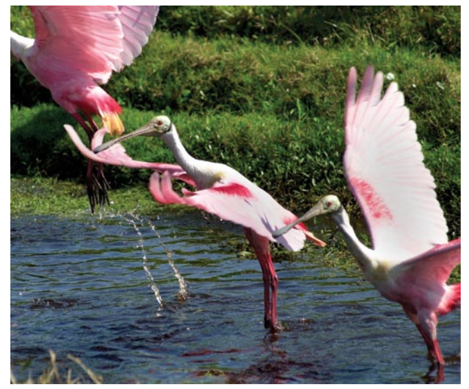
Roseate spoonbills winter in the Wildlife Refuge.

Each Christmas, the Audubon Society conducts a count of the abundant bird population, many of which have migrated from points north. Fishing and duck hunting are permitted in season in certain areas; restrictions apply.