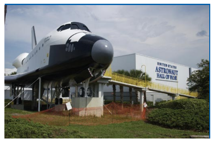
A replica of a space shuttle orbiter (above) is on exhibit outside the Astronaut Hall of Fame.

The U.S. Astronaut Hall of Fame was established by the Mercury Seven Foundation, now known as the Astronaut Scholarship Foundation. It is operated by Delaware North Parks and Resorts, operators of the Kennedy Space Center Visitor Complex.