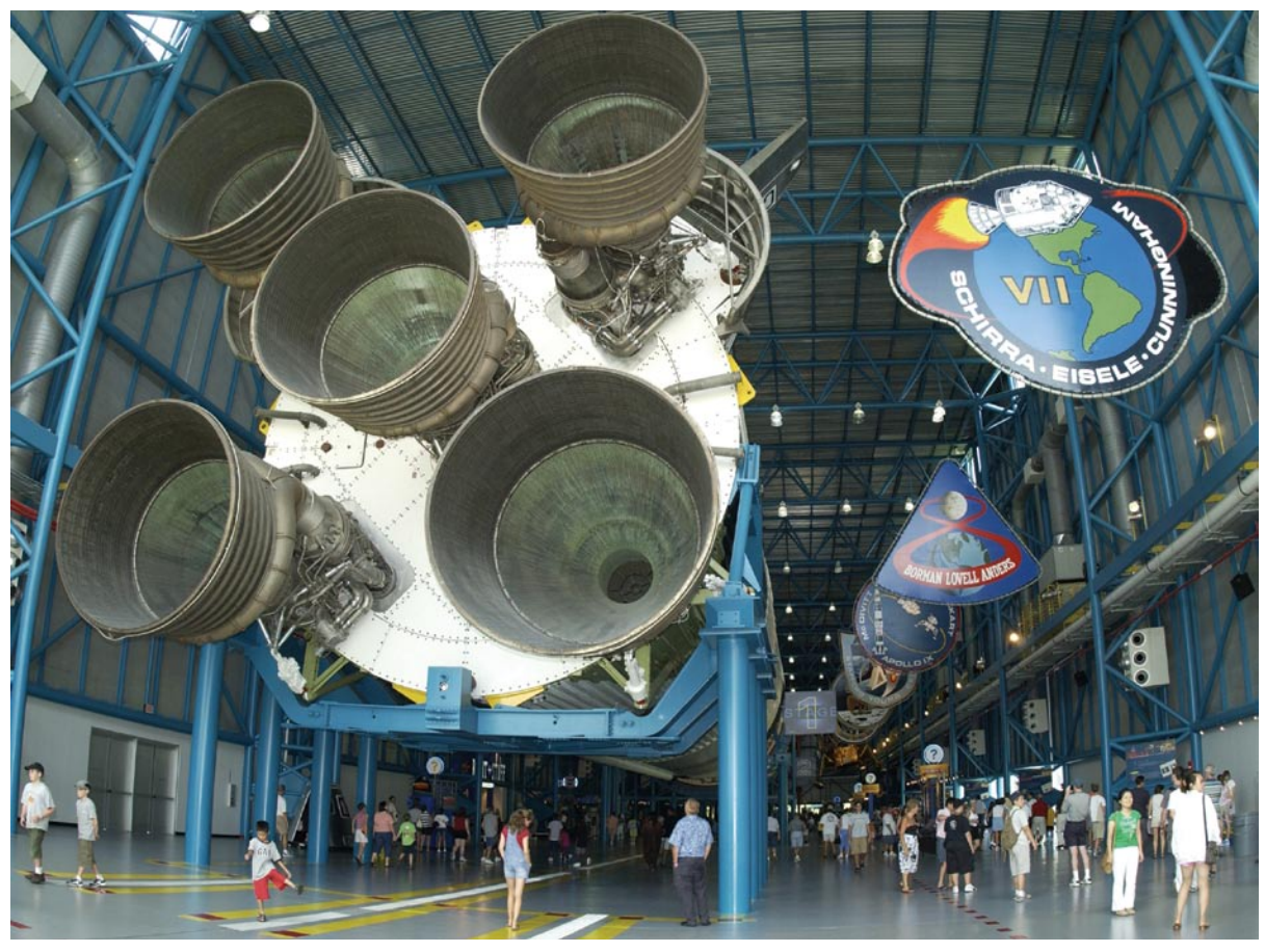
Along with the imposing Saturn V rocket in the Apollo/Saturn V Center, multimedia shows and numerous handson displays provide an inspirational look into America's quest to the moon.